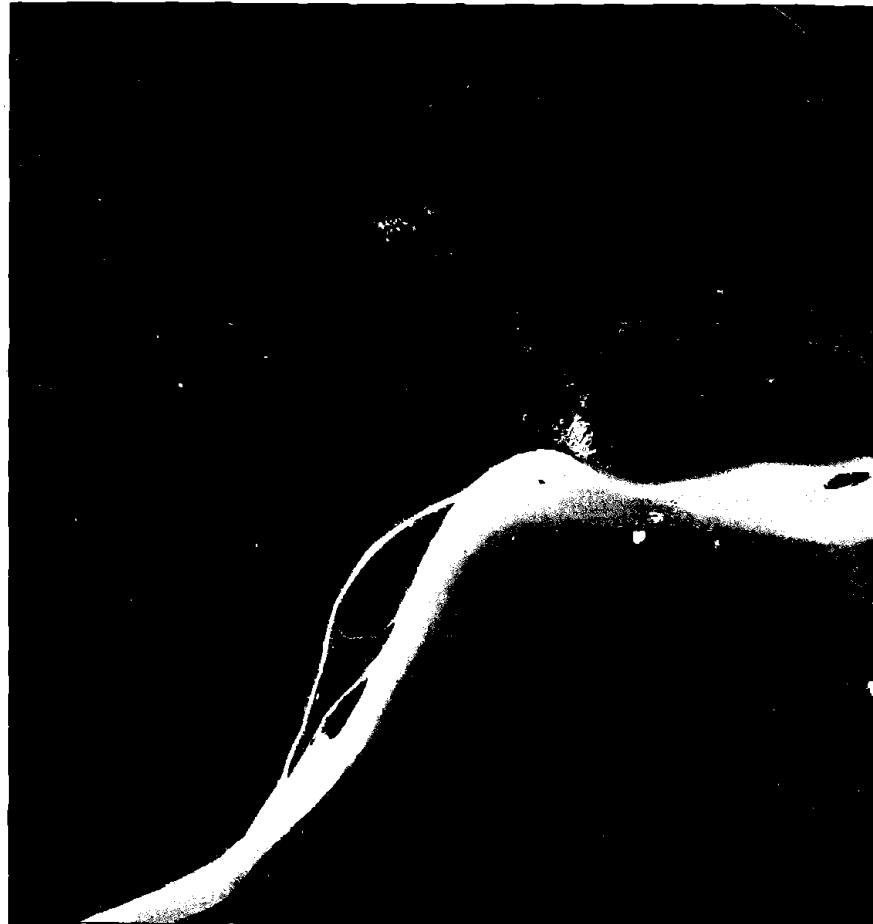
Figure 2. The confluence of the silt-laden Amazon and organic-rich Manacapuru rivers just west of Manaus, Brazil. Image taken with the Earth Observing-1 Advanced Land Imager. The dark color of the Manacapuru results from the high concentrations of dissolved organic matter in the water.

An N leak is fundamentally different from an N loss that can be controlled by biological demand. Leaks occur where biotic systems cannot fully prevent N losses, despite an overall system demand for N. Over time, nutrient leaks need to be replaced by new N, or they will constrain the accumulation of N capital (the sum of N in plants and soils) in an ecosystem. Eventually, such processes can contribute to N limitation of productivity. The hypothesis that DON may function as a leak of N from ecosystems was first developed by Hedin et al. (1995), and based on observations that DON fluxes dominate stream N fluxes in Chilean ecosystems characterized by very low atmospheric inputs of N and high rates of precipitation. Multiple studies have now shown that DON can account for a significant fraction of N losses to streams, despite ecosystem demand for N (Sollins and McCorrison 1981; Hedin et al. 1995; Lajtha et al. 1995; Perakis and Hedin 2002). DON losses are sometimes described as biologically