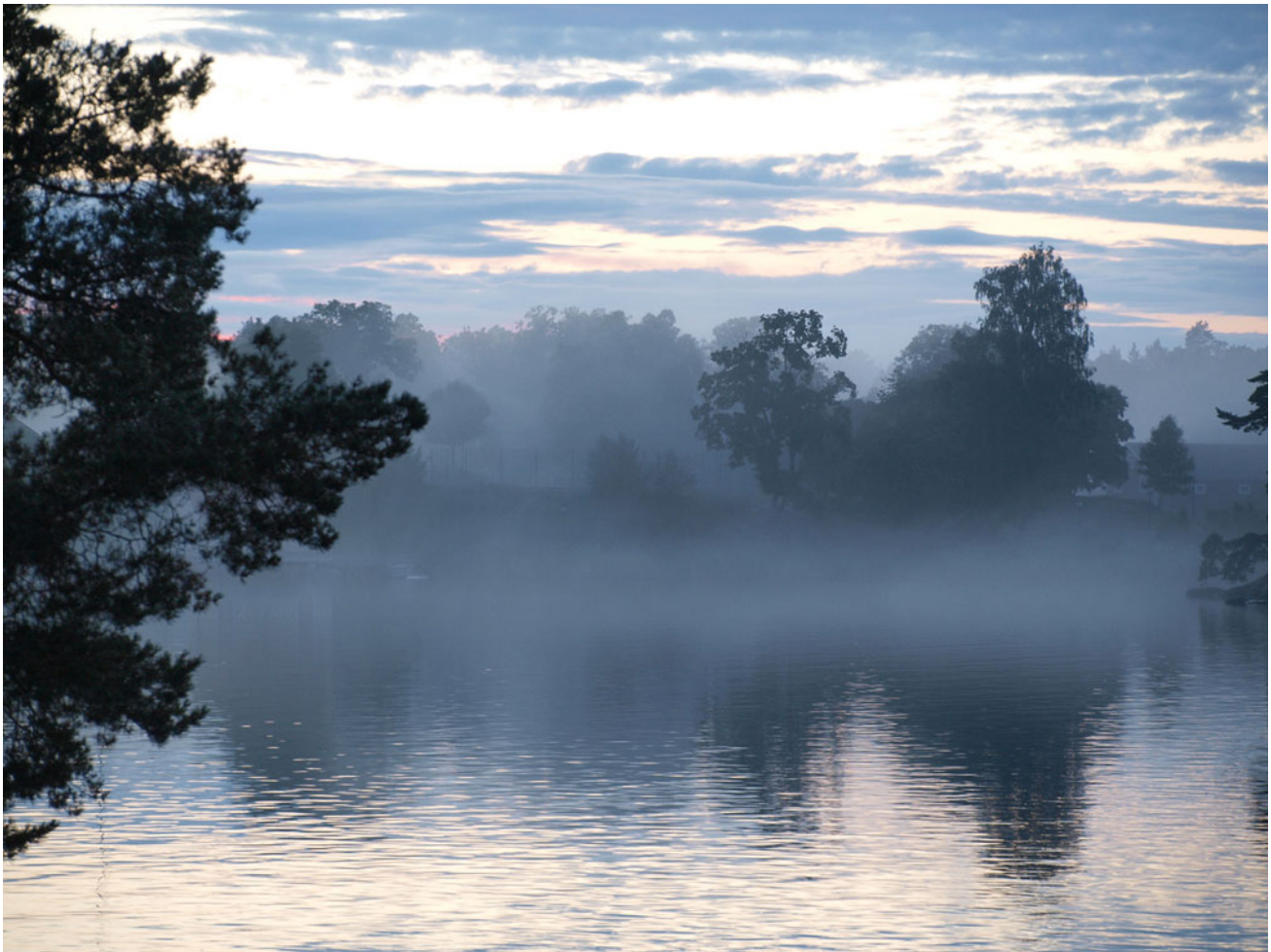
Fig. 1 Reconnecting to the biosphere, Stockholm archipelago, Sweden

past 150 years provided an immense ecosystem service to humanity by absorbing \sim 50\% of the global carbon dioxide emissions (Canadell et al. 2007).