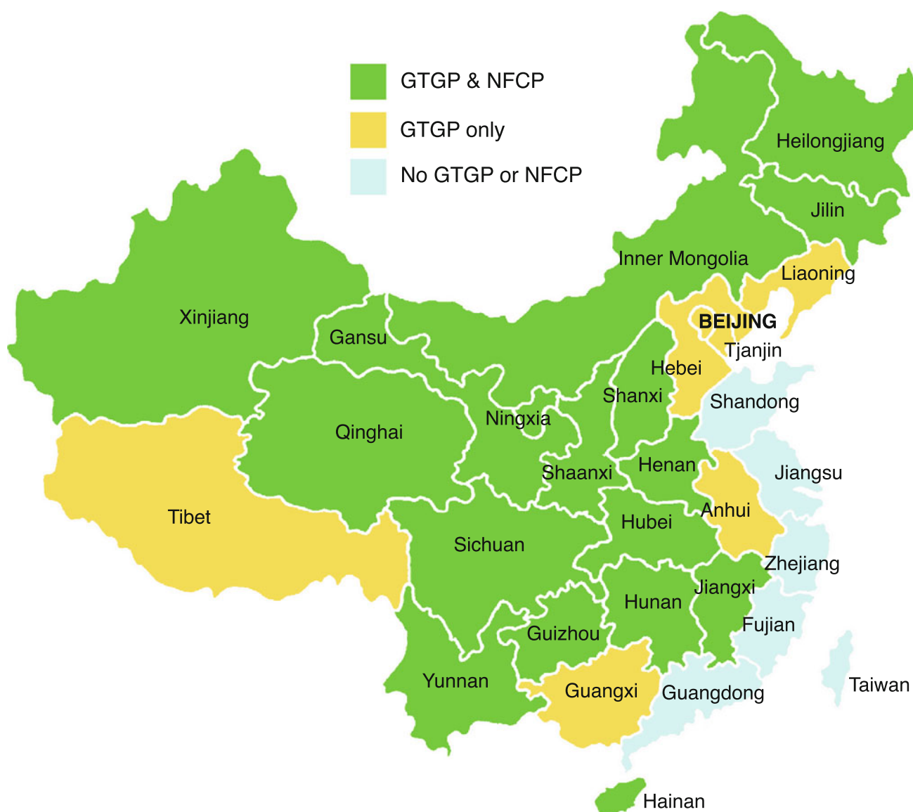
Fig. 6 Current distribution of the National Forest Conservation Program (NFCP) and the Grain to Green Program (GTGP) in China, showing names of provinces, autonomous regions, and municipalities (adapted from Liu et al. 2008)

broader strategies for governance of global dynamics (Walker et al. 2009b). Such governance needs to enhance the fit between institutions and ecosystems (Ostrom 2009; Boyd and Folke 2011) and capture essential social-ecological links and feedbacks in adaptive and multilevel governance (Ostrom 2007, 2010).