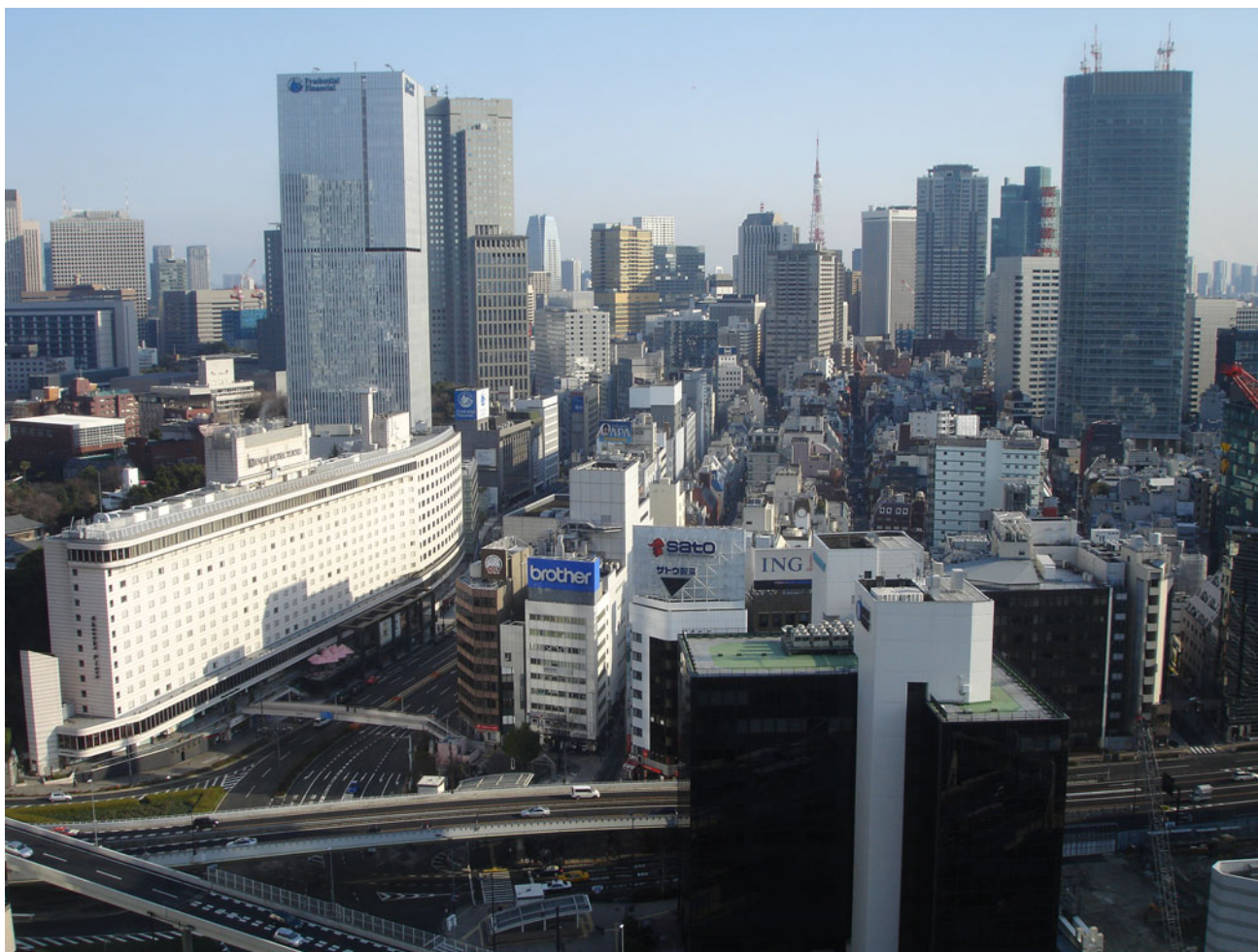
Fig. 8 Shifting mind sets, a challenge for an urbanizing planet, Tokyo, Japan

and intensity of integrated science as a vehicle to explore planetary opportunities for transformations. The need for this social contract is urgent and must be addressed now.