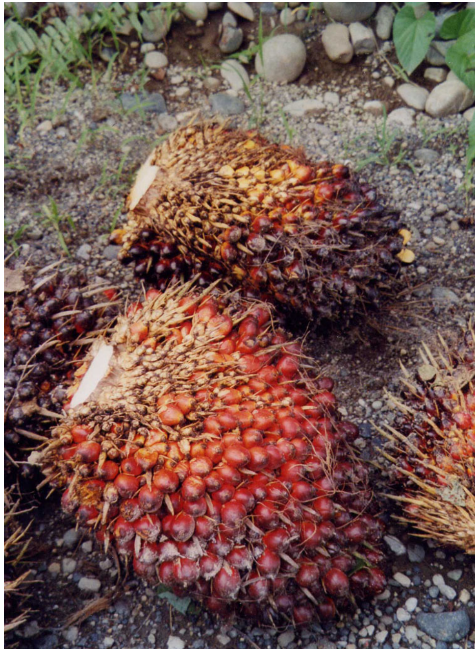
Fig. 4 Fruit of the oil palm Elaeis

new interactions present a range of institutional and political leadership challenges, which have been insufficiently elaborated by either crisis management researchers or institutional scholars (Galaz et al. 2010) (Fig. 5). The above examples draw attention to nonlinear changes, tipping points and thresholds at local to regional scales, with global links and feedbacks, exposing vulnerabilities, challenges, and also opportunities for social–ecological change.