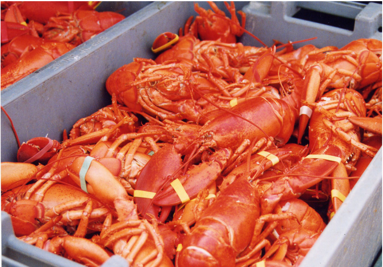
Fig. 3 Cape Cod lobster, Massachusetts, USA

clear that the success is not only a consequence of wise stewardship of one species. Rather, historical overexploitation of fish species has depleted the lobster predators from the Gulf and allowed the lobster population to literally explode into a widespread monoculture in the coastal waters of Maine. Monocultures are known to be susceptible to shocks, a symptom of their low resilience. In southern New England, likely as a consequence of climate change, the lobster fishery has been hit by a disease with about 70% decline in the lobster population (Steneck et al. 2011). Thus, people often inadvertently create social–ecological vulnerability as they adapt and transition from one technology or resource opportunity to another (Holling et al. 1998; Ostrom 2007).